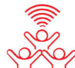
Stage 5: Happiness