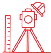
Stage 4: Installation