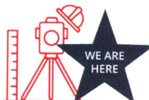
Stage 3: Construction