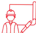
Stage 2: Engineering